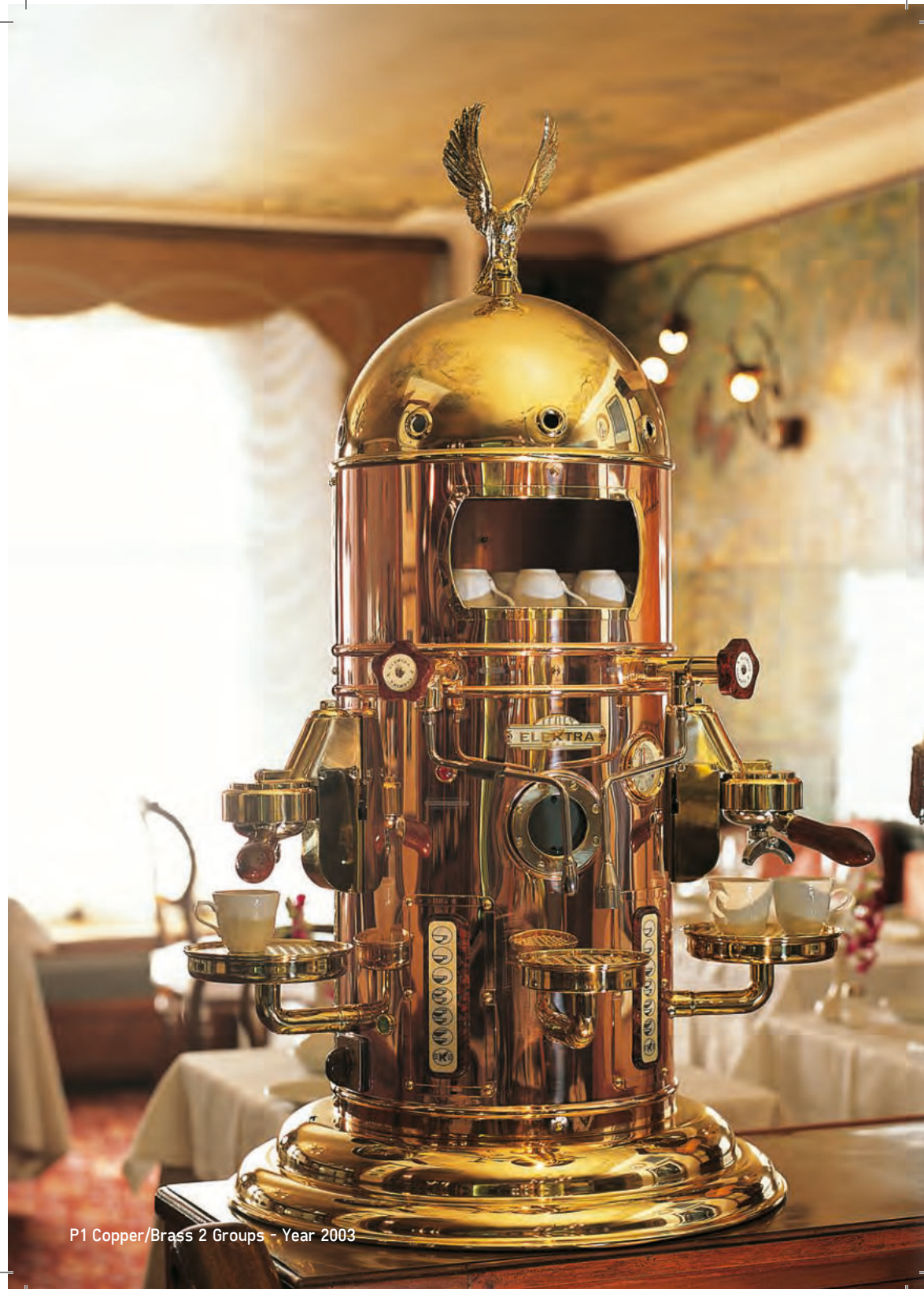
P1 Copper/Brass 2 Groups - Year 2003